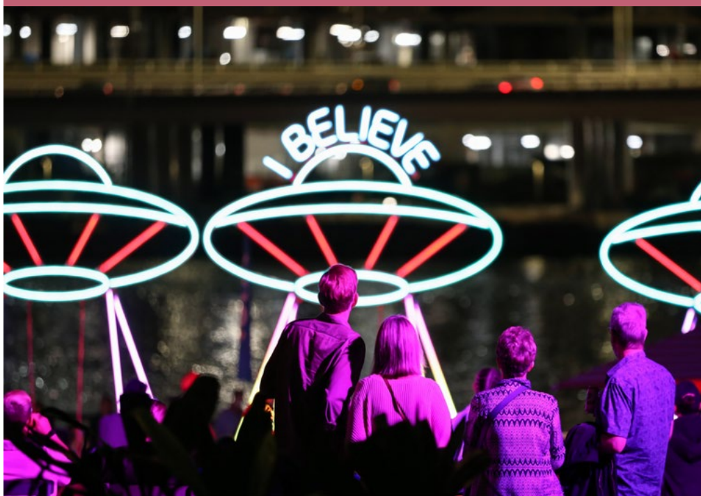
I Believe Swings by ENESS, Brisbane Festival 2021.

Actions in Grow 2022-2026 will support impactful community outcomes that advance social and economic priorities. This will be achieved by working to enhance local arts activity through partnerships and locally led arts engagement.