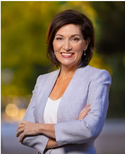
The Honourable Annastacia Palaszczuk MP Premier of Queensland Minister for the Olympics

Over the next four years, Grow 2022-2026 will nurture a brighter, bolder, more diverse and more sustainable creative landscape for our State.