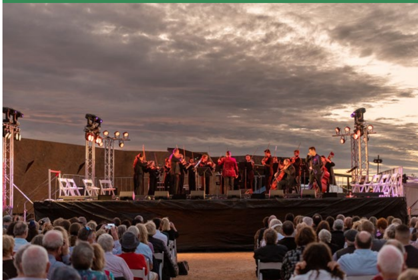
Festival of Outback Opera 2022 in Winton. The Opera Queensland event was a program of outdoor performances in regional Queensland communities. The Festival was supported by the Queensland Government through Arts Queensland and Tourism and Events Queensland. Performances were presented in association with The University of Queensland in collaboration with the School of Music.

Actions in Grow 2022-2026 will focus on enhancing community-led arts experiences across Queensland which are underpinned by inclusive and sustainable cultural infrastructure.