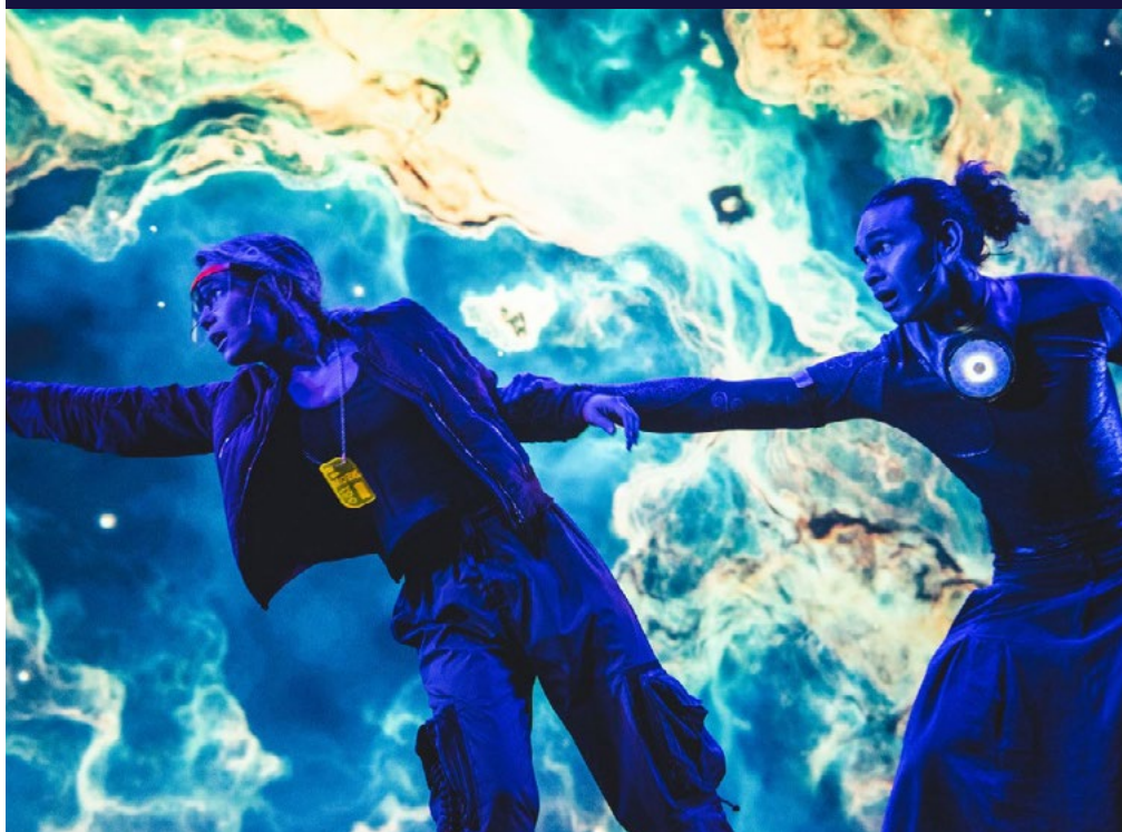
Ishmael a Dead Puppet Society, Queensland Performing Arts Centre, and Brisbane Festival production in association with Screen Queensland, is a reimaging of Moby Dick as a contemporary space saga.

A focus on the development of Queensland's arts, cultural and creative sector's capability and capacity will facilitate sector and creative business growth and increase training and employment opportunities.