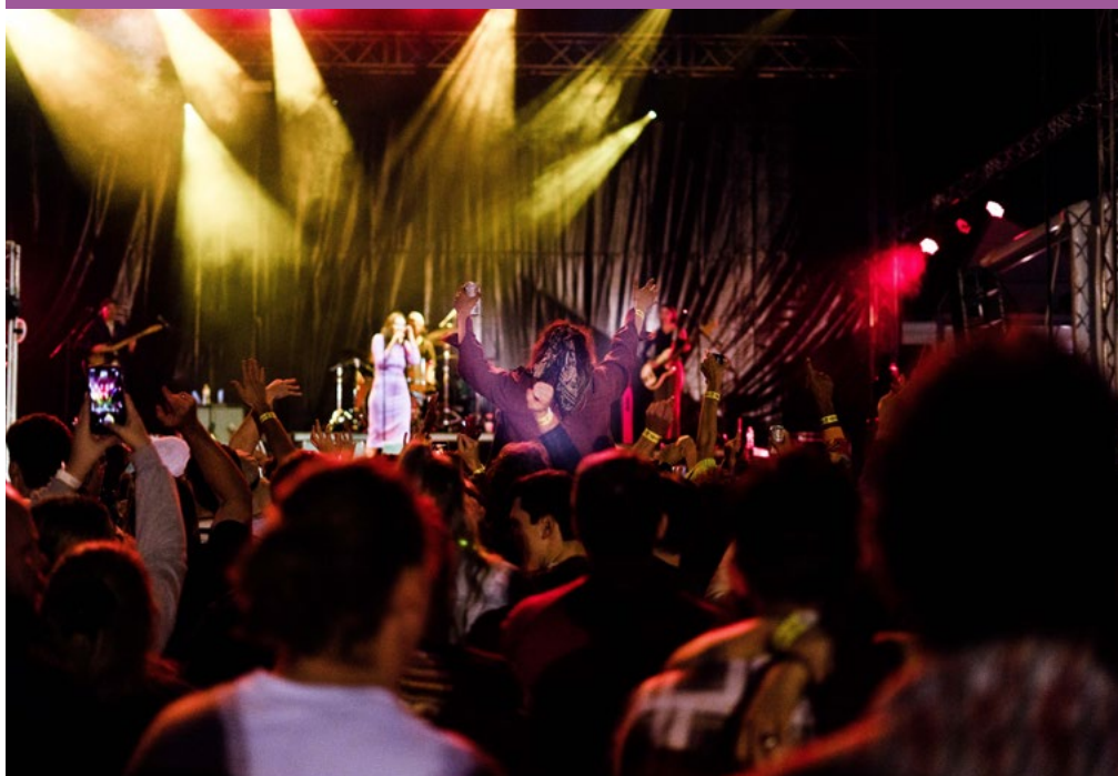
Thelma Plum performing at Tropic Sounds, as part of North Australian Festival of Arts 2022.

Actions in Grow 2022-2026 focus on building strong foundations that will drive arts and culture led economic outcomes across Queensland ahead of Brisbane 2032 and enable a significant legacy. These actions will work to deliver regional growth and inclusive participation and will underpin the state's vision of establishing Queensland as an iconic cultural tourism destination.