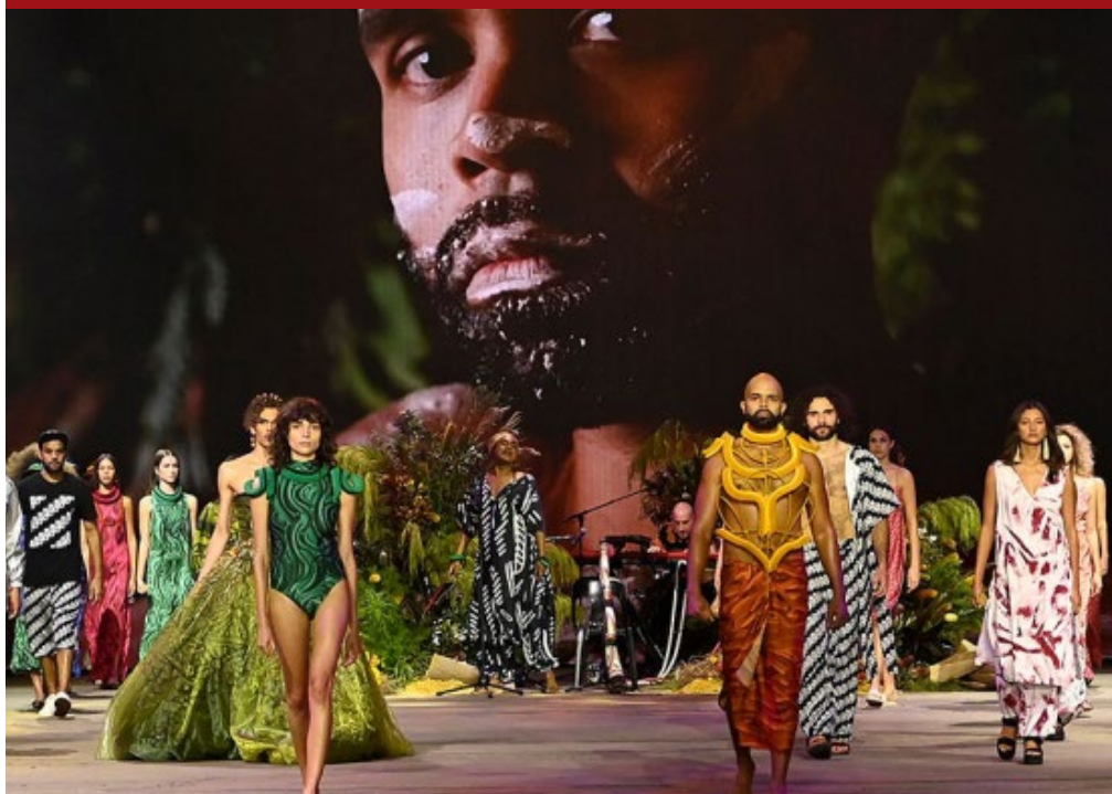
First Nations Fashion: Walking In Two Worlds at the 2021 Brisbane Festival brought together Indigenous fashion dance, film and live music. Works were exhibited as part of the Australian Fashion Week 2021.

Actions in Grow 2022-2026 will foster partnerships, exchange and collaborations that strengthen and celebrate culture and country. Investing in opportunities to showcase and present the state's unique stories and knowledge will ensure Brisbane 2032 is a powerful celebration of First Nations arts and cultures in Queensland.