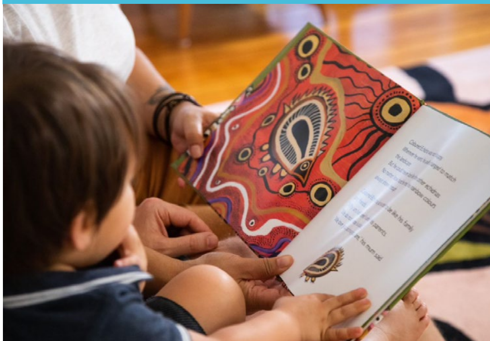
The State Library of Queensland's Stories for Little Queenslanders, showcase Queensland settings, characters and stories, including a story about a cow's hapless journey down a flooded Brisbane River and an alphabet book featuring echidnas exercising in Emerald.

Actions in Grow 2022-2026 will focus on the development and presentation of uniquely Queensland works, celebrating the state's brightest talent and nurturing our future storytellers. The sharing of Queensland's unique and diverse stories will enrich the state's cultural reputation.