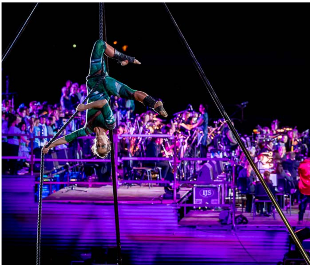
Mount Isa Blast , Queensland Music Festival 2019. The Mount Isa Blast was an outdoor theatrical spectacular created with the Mount Isa community, celebrating the people and the place.

Arts and culture play a significant role in urban and regional development. Actions in Sustain 2020–2022 will grow local arts communities, increase economic participation in arts, and grow and broaden the impact of cultural tourism in Queensland communities. Actions will be delivered through partnerships with local councils, local artists and arts groups, and communities.