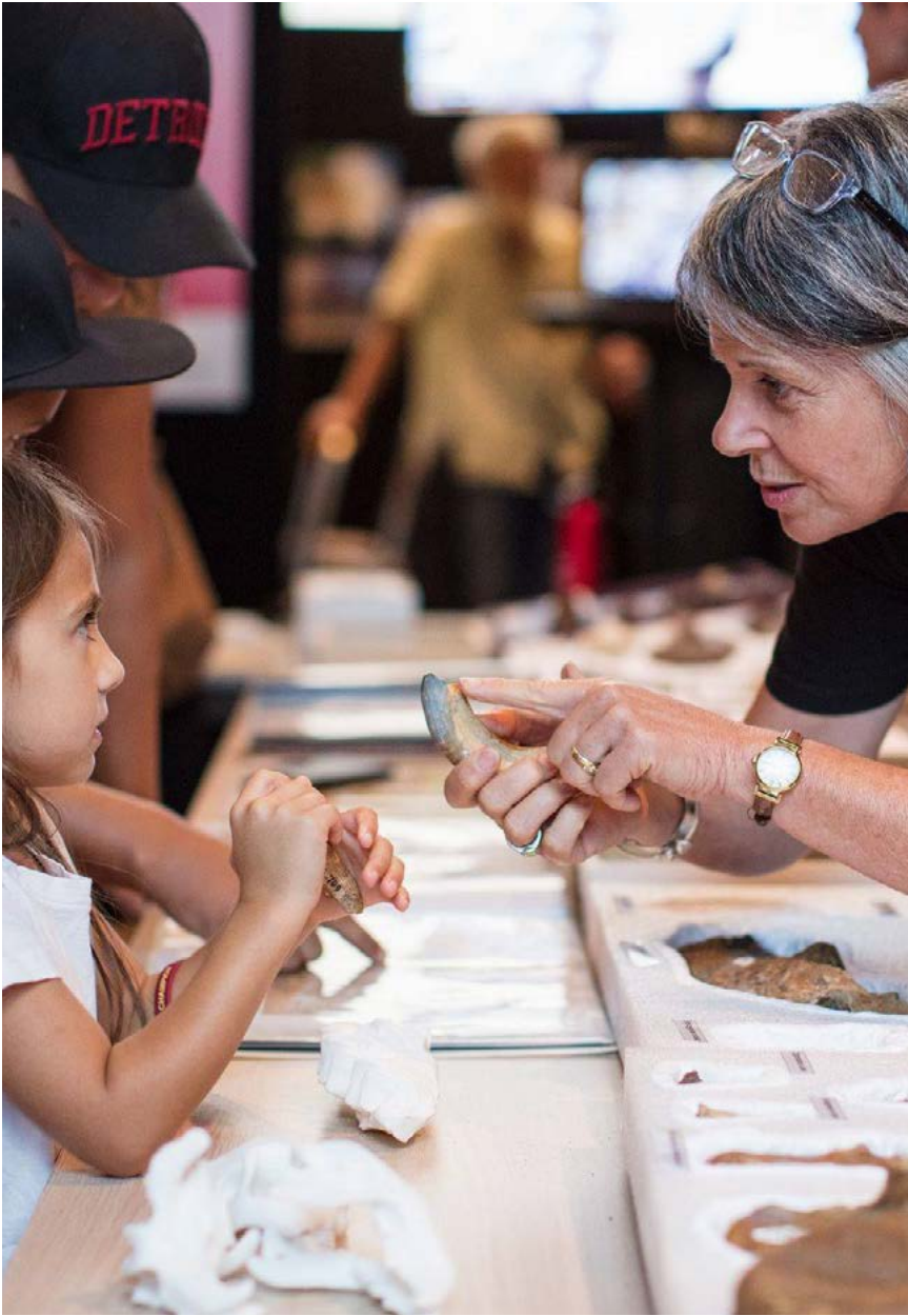
World Science Festival Brisbane. The festival is the only festival of its kind held in the Asia-Pacific region, celebrating human curiosity and a desire to understand the world around us.