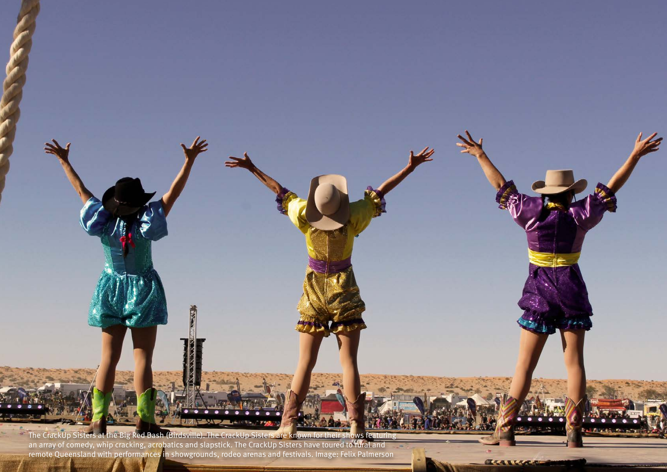
The CrackUp Sisters at the Big Red Bash (Birdsville). The CrackUp Sisters are known for their shows featuring an array of comedy, whip cracking, acrobatics and slapstick. The CrackUp Sisters have toured to rural and remote Queensland with performances in showgrounds, rodeo arenas and festivals.