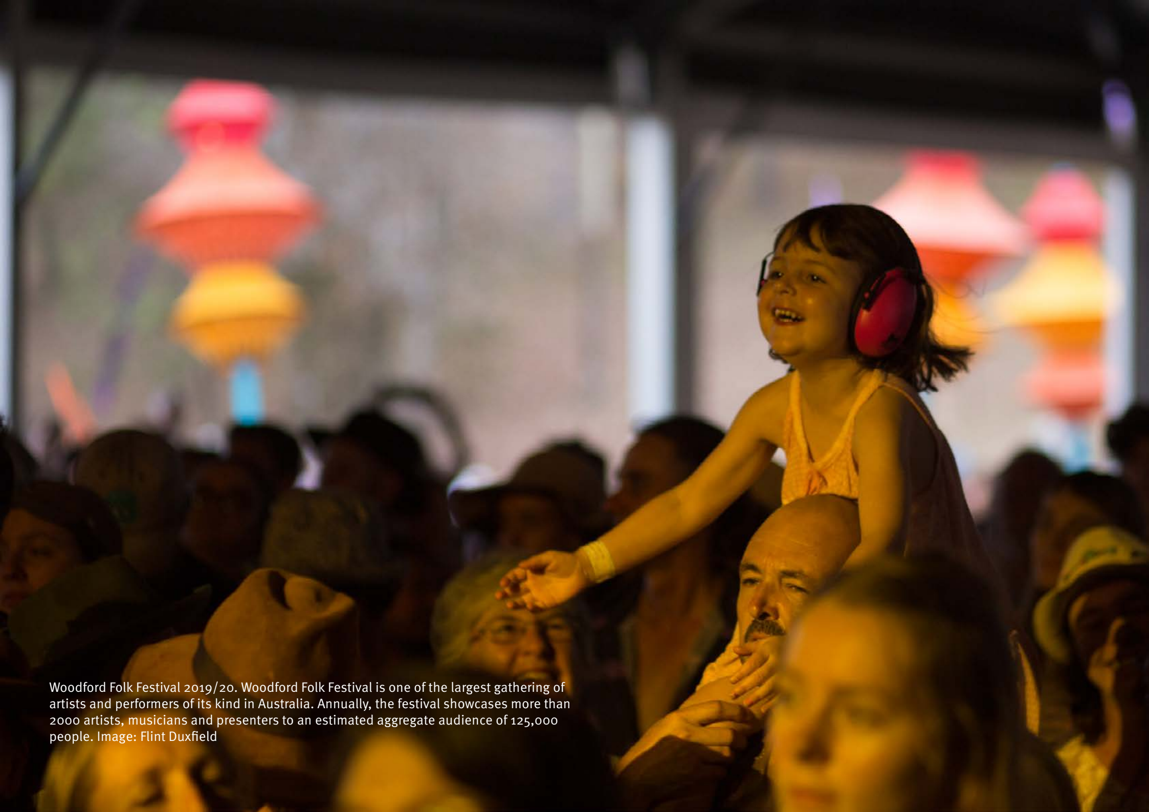
Woodford Folk Festival 2019/20. Woodford Folk Festival is one of the largest gathering of artists and performers of its kind in Australia. Annually, the festival showcases more than 2000 artists, musicians and presenters to an estimated aggregate audience of 125,000 people.