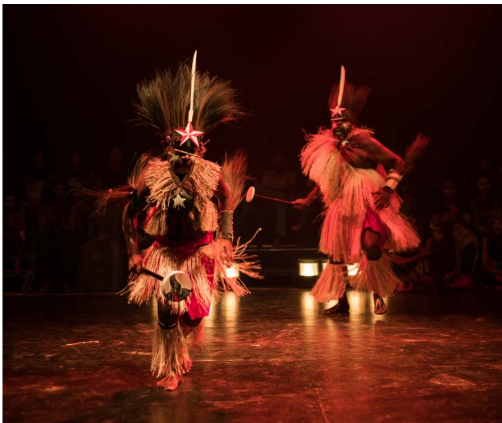
Pryce Centre's guest performers, Kaiyn Kuap - Cairns-based Boigu Island Dancers.

As home to both Aboriginal cultures and Torres Strait Islander cultures, Queensland has the unique opportunity to elevate the awareness, understanding and contributions of First Nations arts. Actions across the next two years will focus on building a sustainable and ethical Aboriginal and Torres Strait Islander arts industry and supporting First Nations artists, organisations and Indigenous Art Centres impacted by COVID-19.