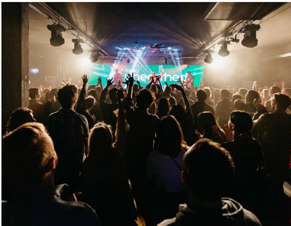
BIGSOUND Festival 2018. BIGSOUND is an annual music industry event bringing together musicians, industry, brands, media and music lovers.

Queensland is home to vibrant places and spaces, from traditional cultural buildings to online spaces. Actions delivered through Sustain 2020–2022 will focus on activating our local spaces and places through support for infrastructure, growing unique programming in cultural venues, building quality online content, and supporting creative experiences in traditional and non-traditional locations across the state.