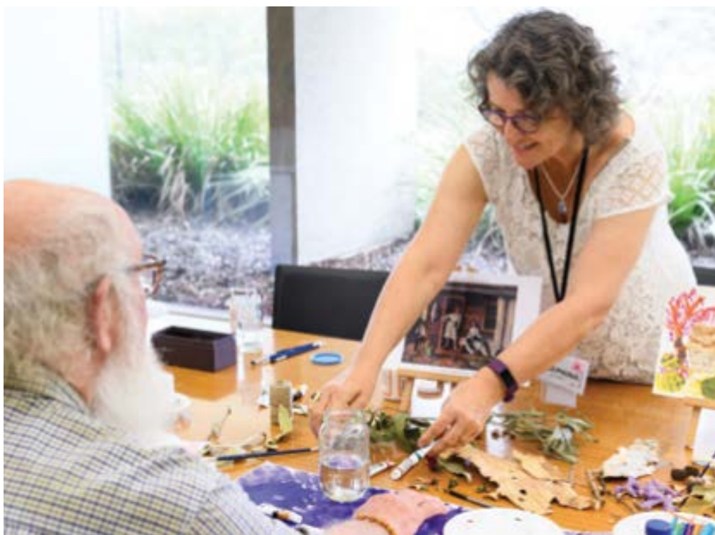
Participants of the Art and Dementia program at Queensland Art Gallery (2019) engaging in tactile and sensory-based tailored activities. Through participant-focused experiences, the program supports the inclusion and wellbeing of members of the community with dementia who are living at home, attending day respite or residing in aged care.

Arts, culture and creativity can be powerful catalysts, offering new and different ways of responding to the social challenges faced in Queensland. Sustain 2020–2022 will focus on driving social outcomes that benefit Queenslanders through partnerships, sector skills development and growing the evidence base.