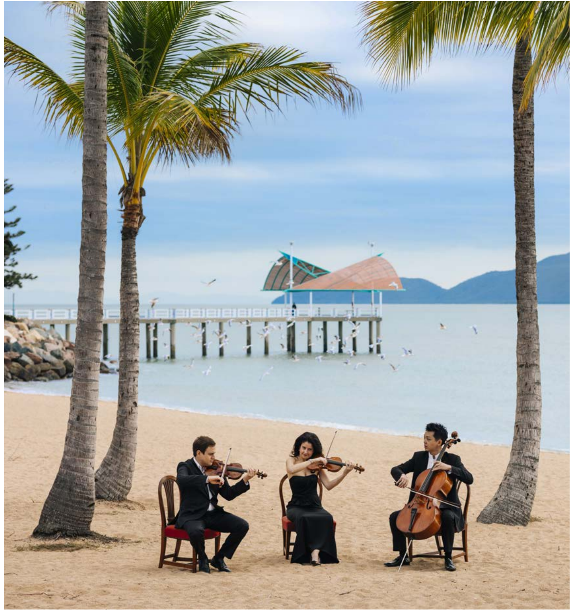
Australian Festival of Chamber Music. The festival attracts internationally acclaimed classical musicians and audiences from Townsville, around Australia and overseas.