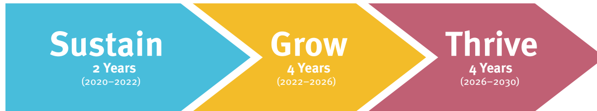
Figure 1: Summary of Creative Together action plans

It is anticipated that the next-stage action plan, Grow 2022–2026 , will focus on growing and amplifying the impact of arts, culture and creativity to support strong outcomes for Queensland. Actions within Thrive 2026–2030 will transition from growth and reconnection to a focus on building a thriving sector that is transforming Queenslanders' lives and their communities.