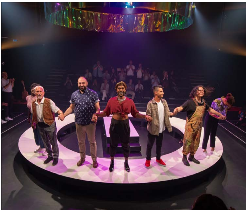
The Neighbourhood presented by La Boite Theatre Company and Multicultural Australia in association with Empire Theatre (Toowoomba). The Neighbourhood featured seven local story-tellers, with tales that spanned migrant and refugee experiences across generations.

A strong arts, cultural and creative sector is fundamental to realising the Creative Together vision of renewing and transforming the state through arts, culture and creativity.